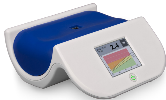
Figure 1: AGE Reader

With an AGE Reader (DiagnOptics, Groningen, the Netherlands), the subject lays his/her forearm on the blue field, so that no outside light can penetrate the 'measurement window'. Light is directed through this window onto the skin for fractions of a second and then the autofluorescence of the skin is measured. The result is displayed on the screen within seconds, together with its age-adjusted reference values. The figure depicts the 'mu' iteration of the DiagnOptics flag product. In contrast to older versions, it utilises light-emitting diode (LED) light source. A shortcoming of the mu reader is the lack of the ability to adjust the measurement time in cases of darker skin pigmentation (low reflectance).