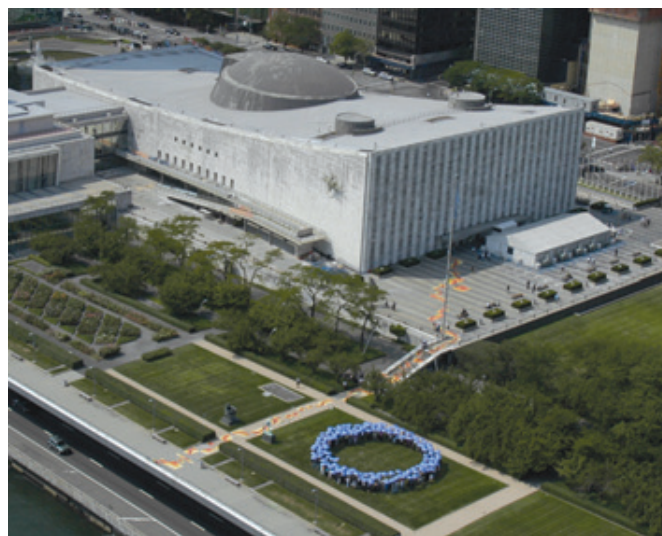
Figure 1: World Diabetes Day at the United Nations Building in New York

Most children with type 2 diabetes are overweight or obese at the time of diagnosis and have a family history of type 2 diabetes and signs of insulin resistance, such as acanthosis nigricans (darkening and thickening of the skin around the neck and in the axillae), high blood pressure, abnormal lipids, and polycystic ovary disease. Although the presentation may be more mild than that seen in type 1 diabetes, with less antecedent polyuria, polydipsia, and weight loss, some of these children also present with severe elevation of the blood glucose level, dehydration and coma. This condition—non-ketotic hyperosmolar coma—has been reported to have a high mortality rate, and underscores the fact that potentially all children with diabetes—type 1 or type 2—are at significant risk of developing a severe metabolic disturbance that can threaten their lives and health.