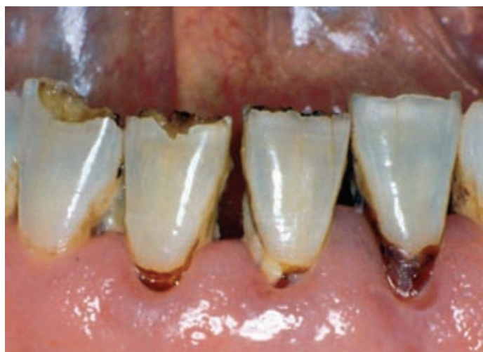
Demineralization is also present on the incisal edges of the teeth due to exposure of the dentin. The patient has reduced salivary flow.

Therefore, the increase in root caries may be secondary to the increased prevalence of periodontitis in patients with diabetes. With loss of bone and periodontal ligament about the teeth, the gingival tissues recedes, exposing the previously covered root surfaces. The root surface, which is covered by cementum, is more susceptible to demineralization than the enamel that covers the crowns of the teeth (see Figure 3 ).