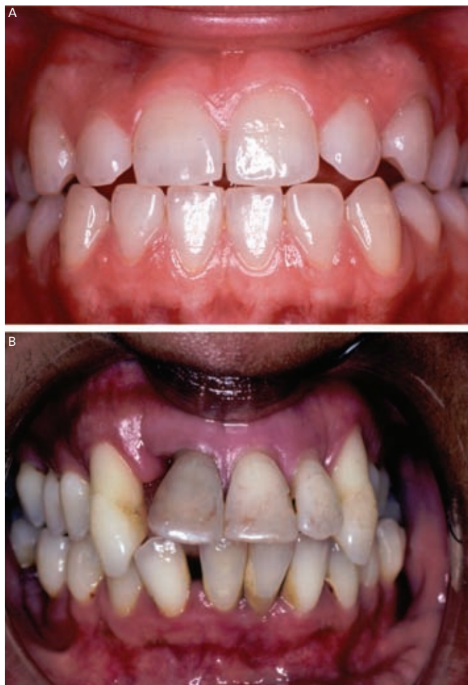
A: Inflammation is minimal and there is no loss of osseous support; B: periodontitis evidence of plaque and calculus deposits, tissue inflammation, drifting and over-eruption of teeth due to loss of osseous support.

Reviews have demonstrated that the extent and severity of periodontitis is greater in patients with diabetes, and diabetes is the only systemic disorder that is a recognized risk factor for periodontitis 1-4 (see Figure 1 ). Taylor and Borgnakke 1 reported that more than 75 % of studies (13 of 17) published from 1960 to 2007 that examined periodontal disease as a complication of diabetes found that periodontitis was more severe when diabetes was present. A review by Chavary and colleagues 2 included studies published between 1980 and 2007. Fifty-five percent of the cross-sectional studies demonstrated significantly greater clinical periodontal disease when diabetes was present. Eight longitudinal studies were also reviewed, four of these examined progression of disease, and three demonstrated that periodontitis progressed more rapidly in patients with diabetes. Similarly, Preshaw and colleagues concluded that individuals with diabetes are at three times the risk for periodontitis compared to those without the disease. 3 Papapanou and Lalla reviewed the interrelationship of diabetes and periodontitis, and concluded that ideal care for patients with diabetes would include an emphasis by physicians on the importance of oral health, and when periodontitis is